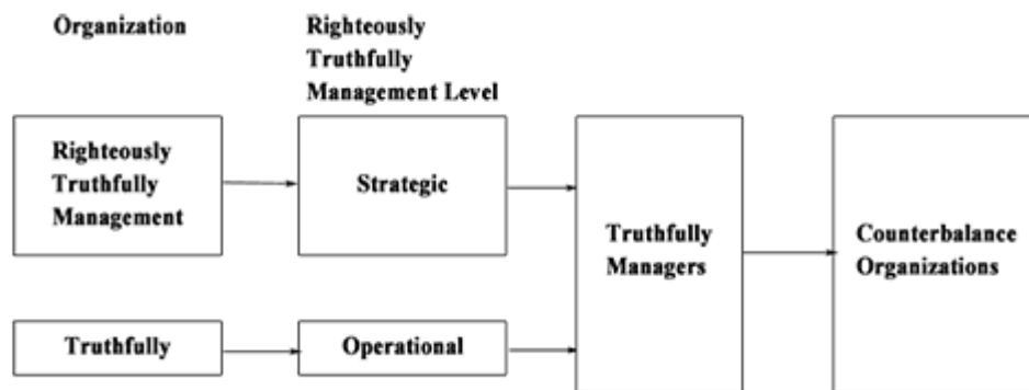
Figure 2. Righteously truthfully management approach

The truthfully strategies tend to have less product innovation than market strategist who aims to compete through innovative product or service features. The third of the generic strategies is the righteously truthfully management strategy. This strategy combines elements of the marketing and truthfully strategy. According to marketing strategy achieves competitive advantage through being the first into new markets with new products. It is innovative and adapts to new technology well. In contrast, the truthfully achieves competitive advantage strategy by being more efficient. This means it does not have to be first into new markets with new products.